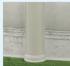
One-piece resin foot collar