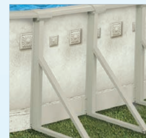
Heavy-duty angle brace system