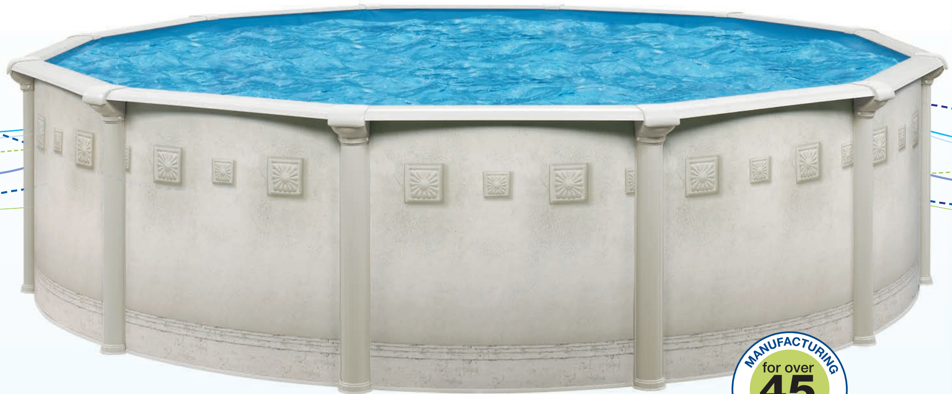
Round Millenium - Tuscan wall offered in 52 and 54 inches

If you're handy with a screwdriver, then you can easily assemble your MILLENIUM CORNELIUS pool. We've designed each pool to make installation problem-free—no multi-sized washers or nuts to worry about. Just one large screw type is used to assemble the entire pool and we provide easy-to-follow instructions.