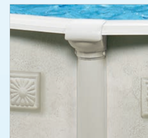
Ledge, cap and post designed for a secure fit