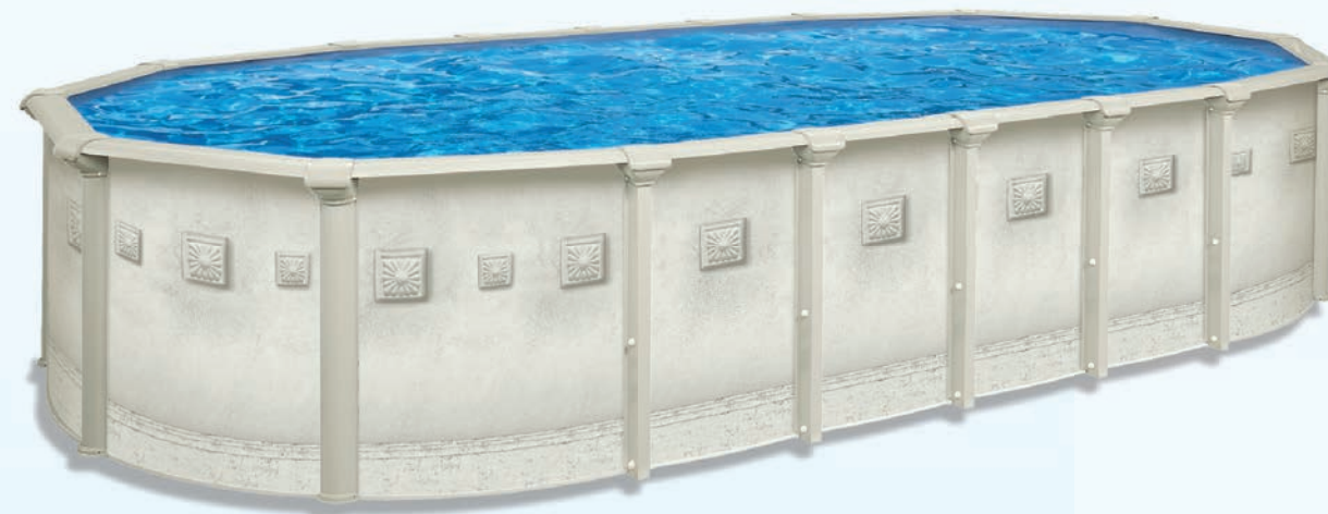
NBS oval Millenium - Tuscan wall offered in 52 and 54 inches